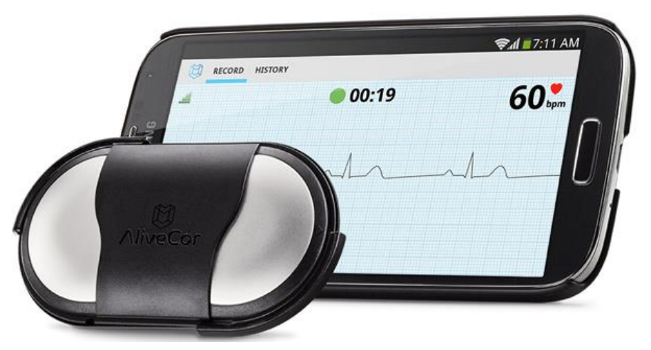
Fig. 2. Mobile Heart Rhythm Monitor from AliveCor

as taking daily heart rhythm readings—can be challenging for many patients to maintain.